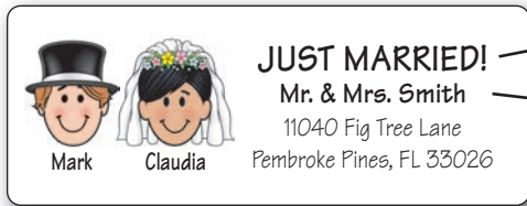
Actual Size: 2 5/8" x 1"