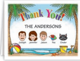
Actual Folded Size: 5 1/2" x 4 1/4"